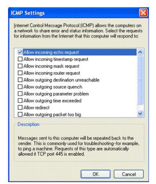
Figure 2-9 ICMP setting interface diagram

Then click Start—Run of test computer 1, enter cmd or command (cmd for Win2000/XP system, command for WIN98/95 system), a console window will pop up, and send ping 192.168.0.11 –I 1000 –t, (–I It refers to the number of bytes to send data packets, -t refers to continuously sending data), run ping 192.168.0.10 -I 1000 -t in test computer 2 in the same way. If test computer 1 returns Reply from 192.168.0.11: bytes=1000 time<10ms TTL=128, test computer 2 returns Reply from 192.168.0.10: bytes=1000 time<10ms TTL=128, use CTL+ after running for more than 10 minutes The C command statistics packet loss rate is 0, indicating that the device is working normally. As shown in Figure 2-10.